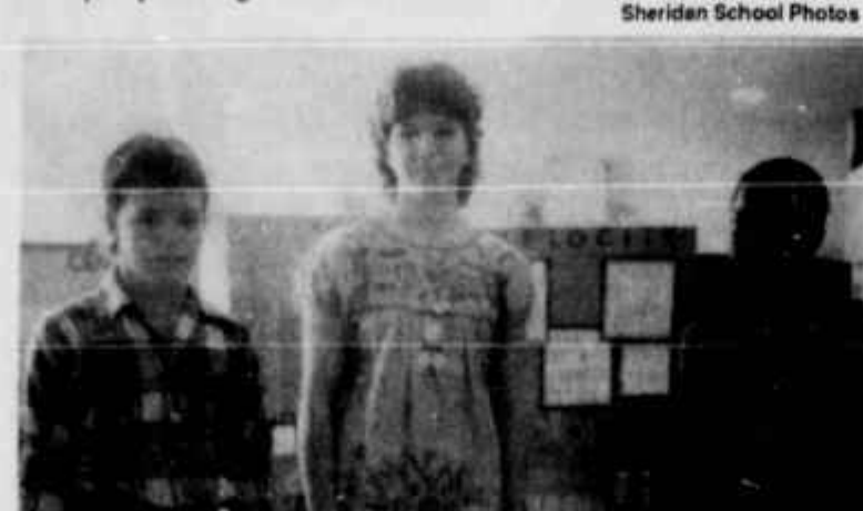
Sheridan School Photos